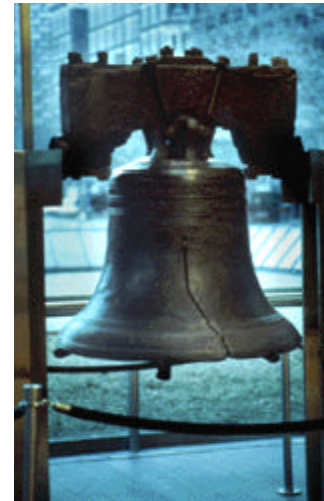
The Liberty Bell