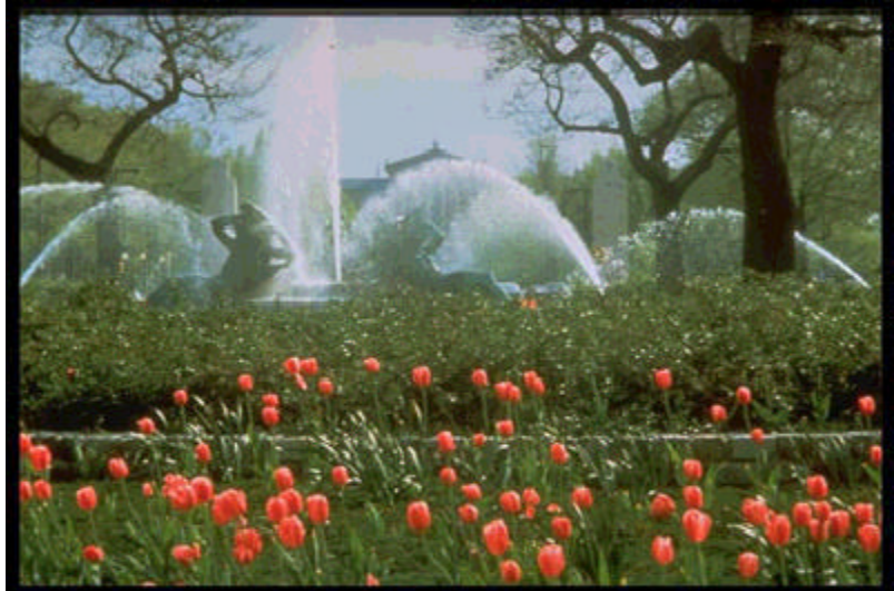
Logan Circle on Benjamin Franklin Parkway

Education appears to be the cornerstone of President Bush's approach to federal-state and federal-local relations. Although the White House serves as a forum for education issues and the federal government provides important educational funding, the real work in education is done at the state and local levels. What are some of the education issues that will take center stage in the Bush Administration and how will it affect state governments, local municipalities, and school districts? In addition, how have states measured up in allocating money for education? Despite lawsuits and legislative haggling, grave disparities still persist between rich and poor schools within states and across states.