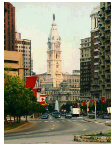
The Benjamin Franklin Parkway

A prominent Delaware River waterfront neighborhood steeped in America's history, Society Hill is a upscale prototype for urban restoration. Enjoy the architectural styles of hundreds of historically significant townhouses and places of worship.