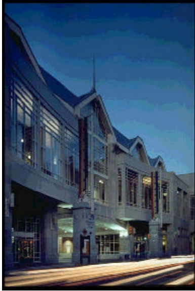
Pennsylvania Convention Center