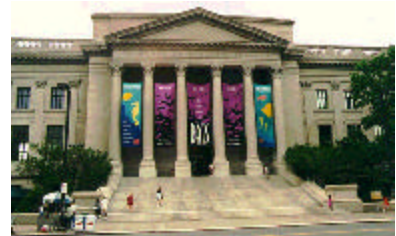
Walk through a giant model human heart following the path of blood circulation, catch a flick on the amazing IMAX theatre, or visit the state-of-the-art forecast weather center at the Franklin Institute Science Museum.

5:30-7:00 p.m. GRA Reception (spouses welcome)