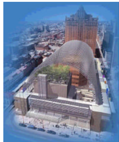
Avenue of the Arts