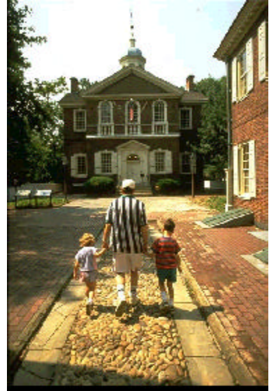
Take a stroll through historic Olde City Philadelphia. Tour Ben Franklin and Betsy Ross' homes. See where the Declaration of Independence was penned and where the Constitution was signed.