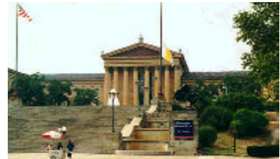
Make a visit to Philadelphia's world-famous Museum of Art. It's free until 1:00 p.m. on Sundays.

Governmental Research Association 2001 Annual Conference Rittenhouse Square Sheraton Hotel August 5-8, 2001 Philadelphia, Pennsylvania